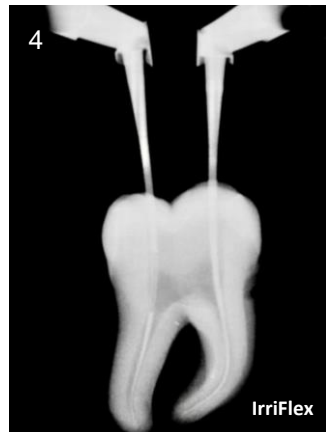
Fig. 3. and 4. Insertion depth of the inflexible 30G side vented metal needle and the flexible IrriFlex needle in a straight distal, and in a curved mesial canal of a mandibular molar.