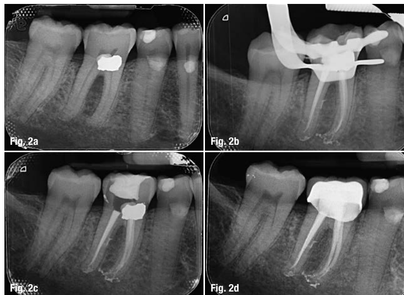
Figs. 2a–d: First mandibular molar with acute pulpitis (a), endodontically treated (Micro-Mega System 2-Shape for instrumentation and Produits Dentaires SA IrriFlex for irrigation). The obturation (b & c) demonstrates the excellent cleaning result by filling the apical delta of the mesial root and the accessory canal of the distal root. Control radiograph at 3 months with a peripheral cap (d).

At present, we know that passive ultrasonic irrigation of the root canal is more effective than syringe/needle irrigation in removing residual pulp tissue and dentine debris and also allows a more significant reduction in the level of intra-canal bacteria. 13,14 However, studies on the removal of dentine slurry have been inconclusive to date,