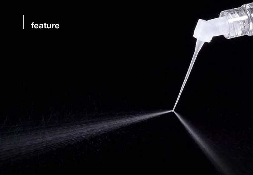
Fig. 3: IrriFlex 30G plastic needle with 2 lateral openings on the same level (Produits Dentaires SA).

bacteria as well as bacteria grouped together in biofilm communities. 18